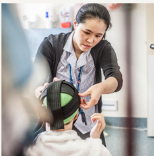
Scalp cooling caps