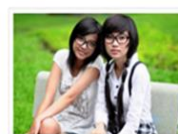
Consumer and Community Involvement Internationally