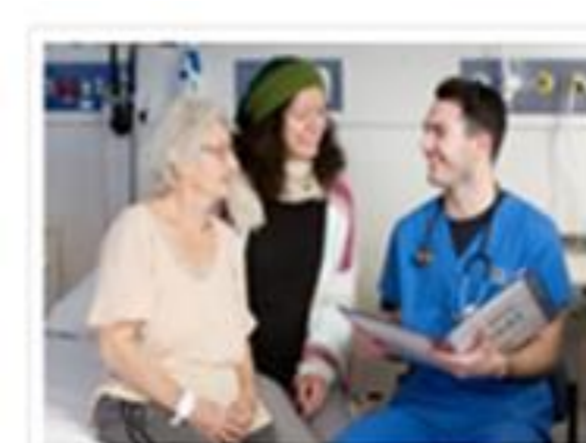
What is Consumer and Community Involvement?

In response to the COVID-19 pandemic, we co-developed tip sheets on how to engage with the community online, and formed and trained a COVID-19 consumer advisory committee to support researchers and health professionals in COVID-19 funding applications and healthcare improvement efforts.