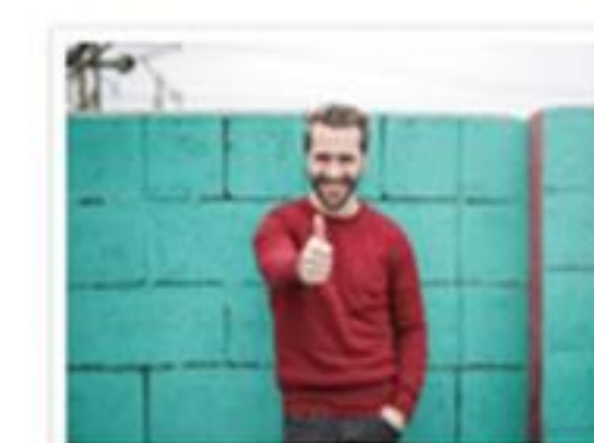
Who are consumers in Health Research