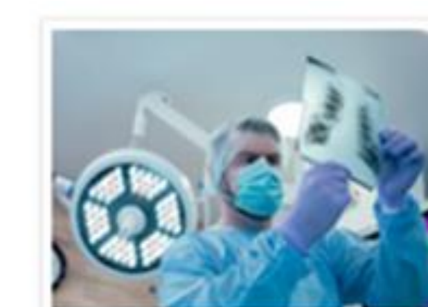
Consumer and Community Involvement in Australia