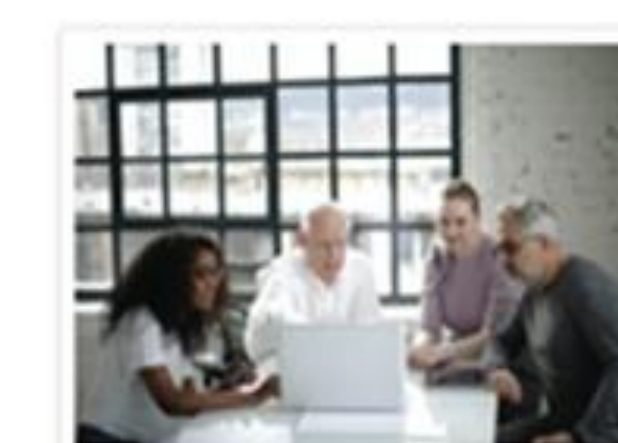
Embedding Consumer and Community Involvement in Research and Healthcare Improvement