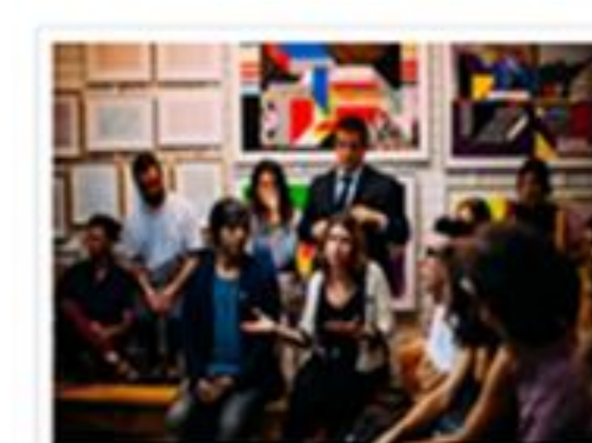
The difference between consumer engagement, participation and involvement